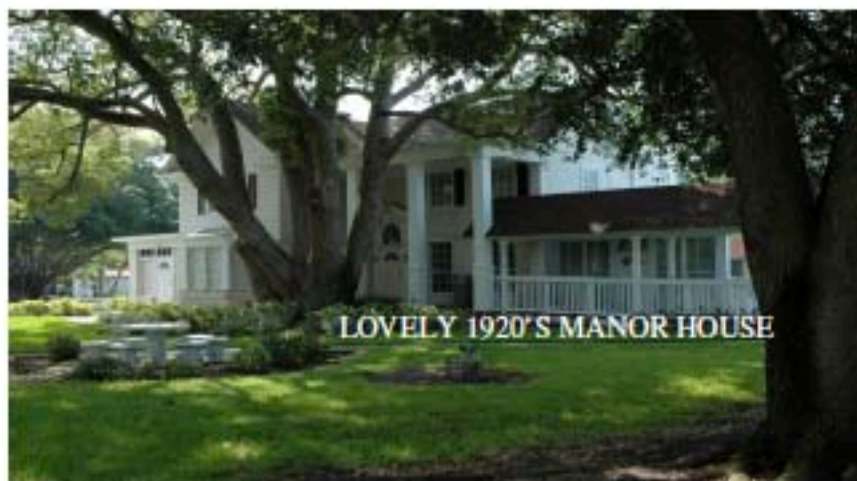
LOVELY 1920'S MANOR HOUSE

STRICTLY CONFIDENTIAL, AND SHOWN BY APPOINTMENT ONLY; TENANTS ARE UNAWARE OF POTENTIAL SALE