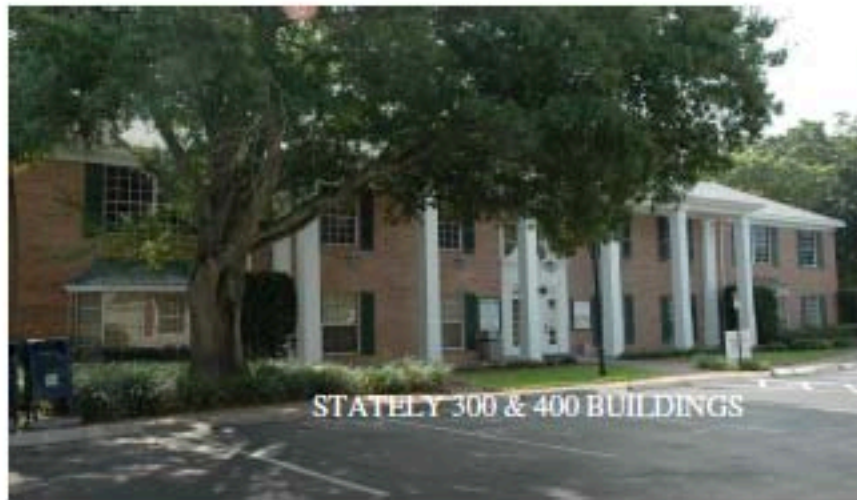
STATELY 300 & 400 BUILDINGS