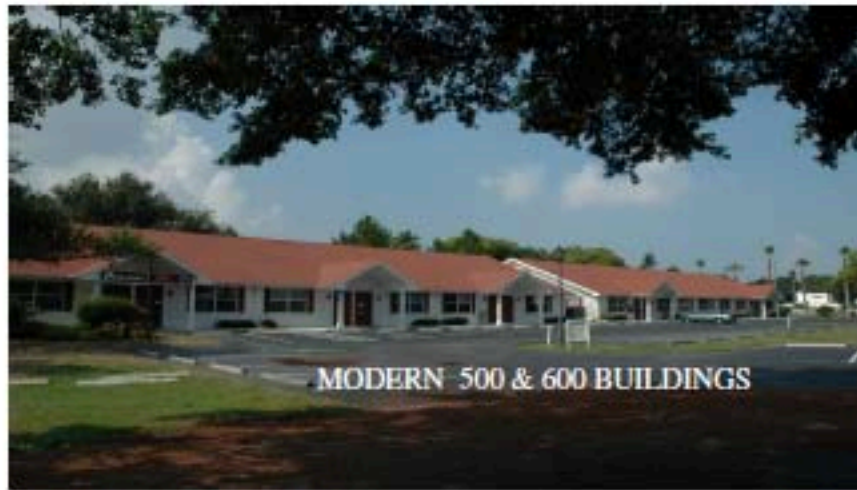
MODERN 500 & 600 BUILDINGS